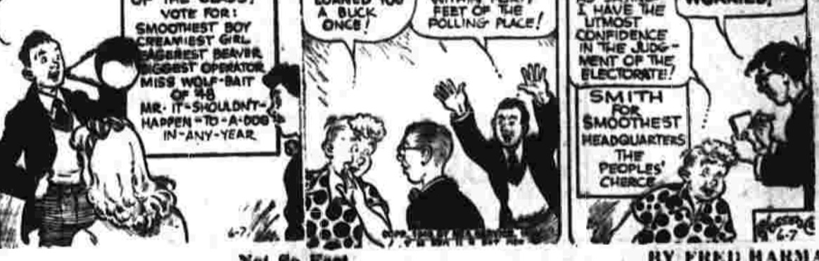
Not So Fast