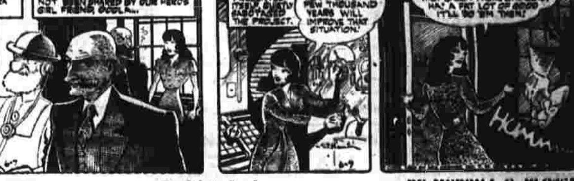
Wrench In The Works